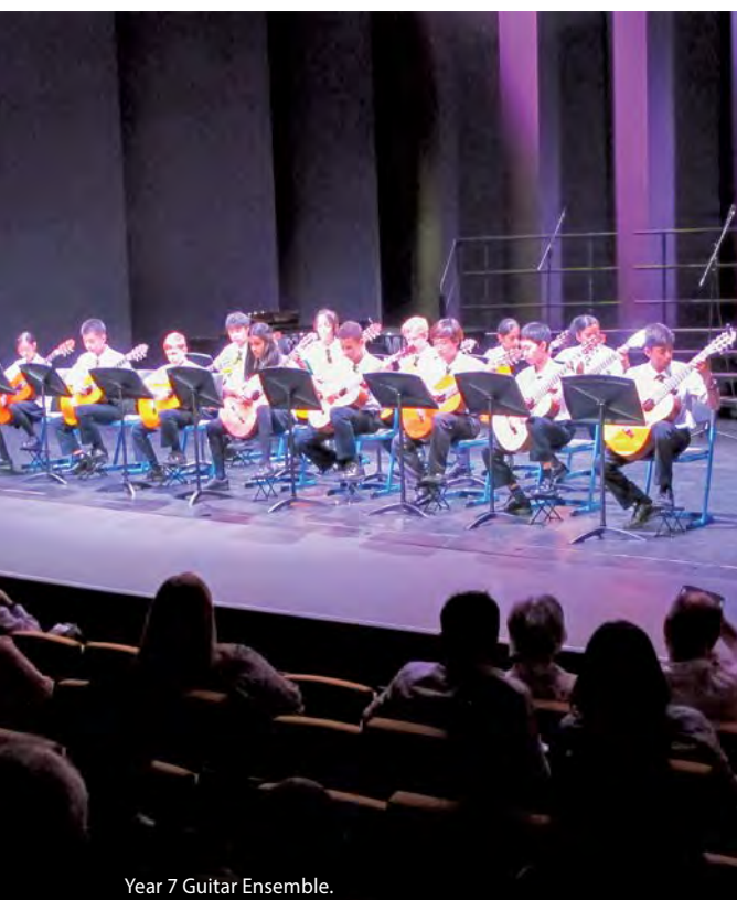
Year 7 Guitar Ensemble. Ripieno.

The Summer Concert featured both the Year 7 choirs, Year 7 Guitar Ensemble, Junior Contemporary Ensemble, Junior Percussion Ensemble, Year 8 Choir and Ripieno. What a wonderful way to finish the year and a great opportunity for the students to watch each other in performance.