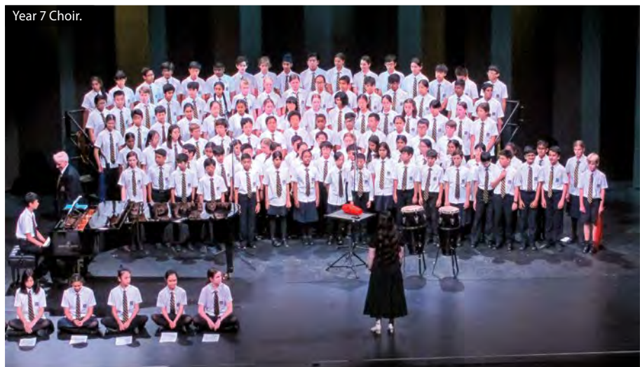
Year 7 Choir.