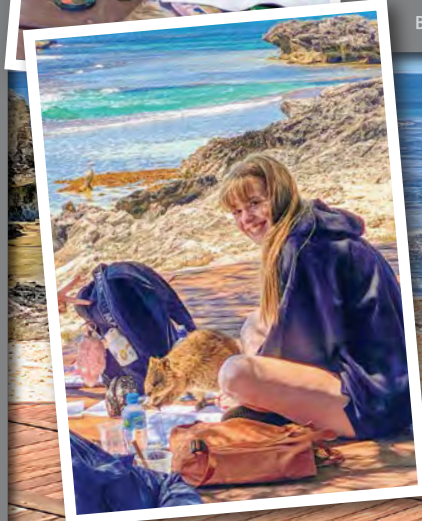
BELOW: Visual Art activity students enjoying the view.