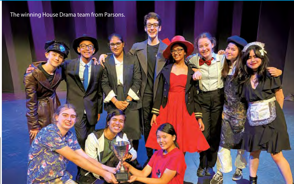
The winning House Drama team from Parsons.