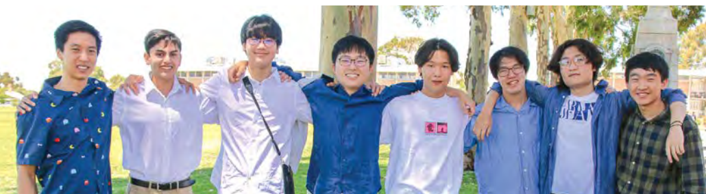
△ Many students formed study groups sharing resources and helping each other along.