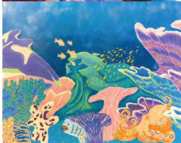
FROM TOP: Students working on the Coral Bay biodiversity mural; and the finished mural.