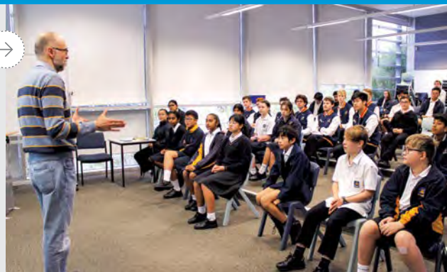
^ The Perth Molecules Lecture series was really popular in 2021.

As always, our speakers were very impressed by the behaviour and level of questions they received from the students. Our sincere gratitude to all of the presenters who gave so generously of their time.