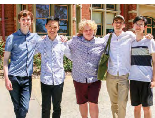
▽ Students were delighted to return to the school after finding out their results to congratulate one another.