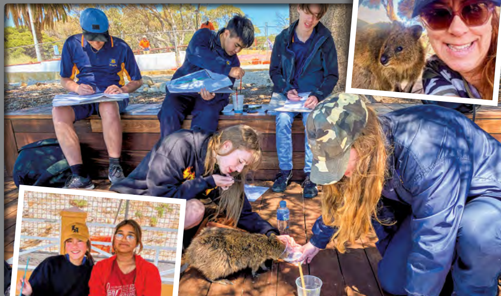
ABOVE: Students making friends with a quokka.