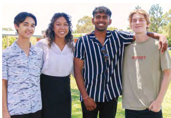
△ The Class of 2021 achieved a median ATAR of 96.45, topping the state for the sixth consecutive year.