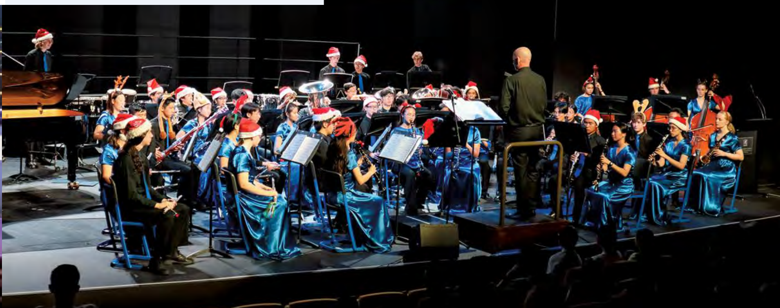
Senior Wind Orchestra.