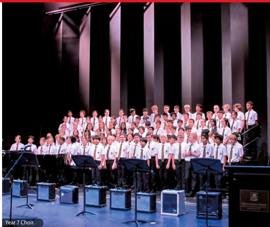
Year 7 Choir.