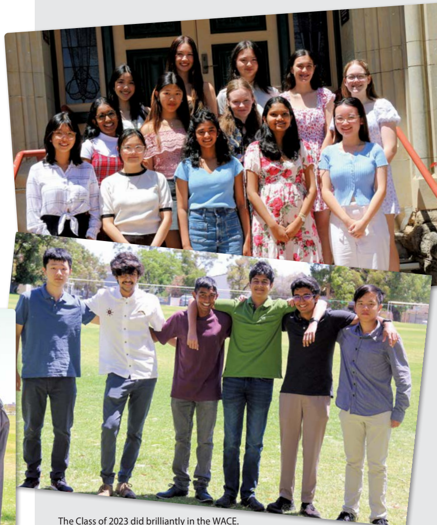
The Class of 2023 did brilliantly in the WACE.